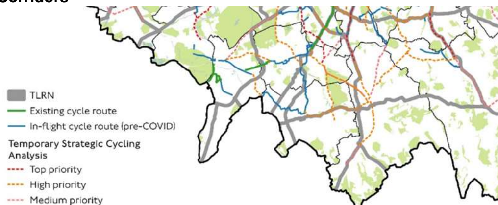
Figure 1 Image from TfL's Temporary Strategic Cycling Analysis Priority Corridors

The Strategic Neighbourhood Analysis identified the potential for low traffic neighbourhoods across London, and where the greatest need may be. The Analysis allocated 'neighbourhoods' two scores, a traffic filtering score and a general score. These are combined in Figure 2 below. The traffic filtering score is based on: